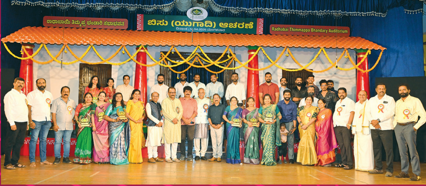
ಬಿಸು (ಯುಗಾದಿ) ಆಚರಣೆ