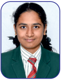
NYDILE T Y 457, 91.40%