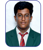
PURVAJ N 468, 93.60%